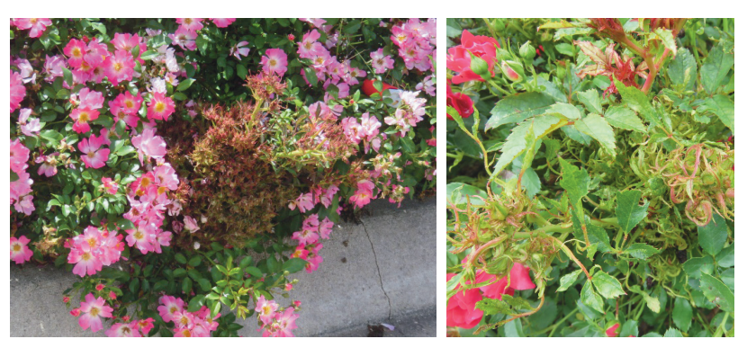
Figure 3. Rose rosette disease symptoms in roses in the landscape.