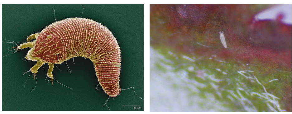
Figure 1. Phyllocoptes fructiphilus, the vector of rose rosette virus in rose.

In the 1800s, the multiflora rose was introduced into the U.S. from Japan, China, and Korea. Beginning in the 1930s, the U.S. Department of Agriculture encouraged the use of multiflora roses because they were said to be ideal for erosion control and living fences, making them a popular choice for planting throughout the U.S. It wasn't until the 1950s that these multiflora roses were recognized as invasive weeds. There was a need for biological control for the multiflora rose as it started to take over much of the landscape in many states. References to witches' broom and rose rosette disease (RRD) were found, which led to the possibility of a biological control agent, the eriophyid mite— Phyllocoptes fructiphilus (Figure 1). The eriophyid mite was discovered in the 1940s when diseased rose plants were first observed in both California and Wyoming. These mites ( P. fructiphilus ) were found to be associated with RRD. Not much information is known about these mites and how they transmit the virus and cause RRD, but studies are underway to understand the mite's biology and how it transmits the disease.