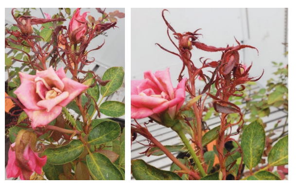
Figure 2. Rose rosette disease symptoms in potted rose plants.

RRD is caused by the rose rosette virus (Emaravirus) that affects multiflora and ornamental roses. This virus is causing devastation to roses in several regions of North America, but it is particularly problematic in the eastern half of the continent. It has been estimated that about 93% of rose plants that are susceptible to this disease have the potential to be killed in a matter of decades. The symptoms of disease on ornamental roses are a yellow mosaic pattern appearing on leaves, increased thorniness, abnormally shaped foliage and early production of lateral buds that make up the witches' broom (Figures 2 and 3). The symptoms differ slightly in multiflora roses. These roses still get witches broom and misshapen foliage. Unlike the ornamentals, they get a reddish-purple vein mosaic pattern on their leaves and produce bright-red foliage and lateral shoots. The disease eventually results in death of the infected plant.