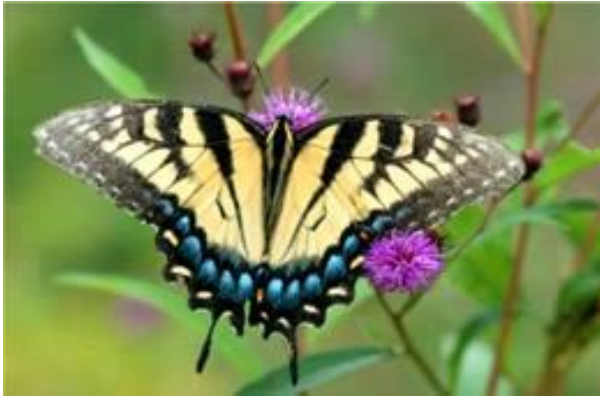
Tiger swallowtail – male