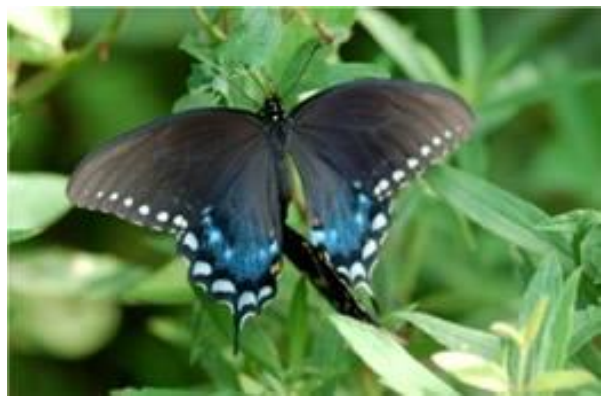
Tiger swallowtail – female can be yellow or black