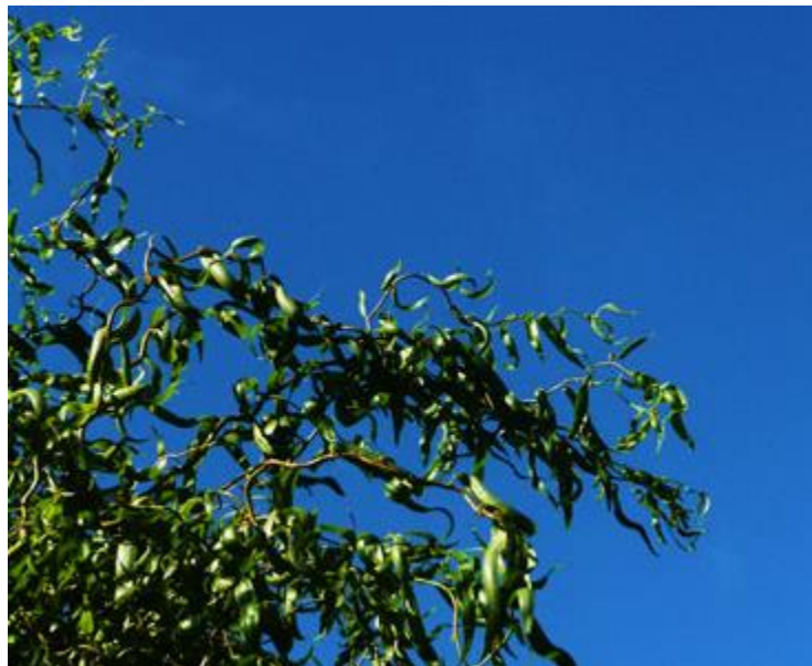
Willow and Sky

Email granny@grannysgardenschool.org to join us for our next gardening experience!